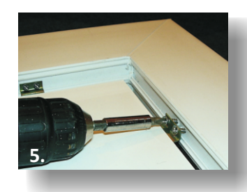
Fix each clip into the profile. It is not necessary for the screws to be driven right home.