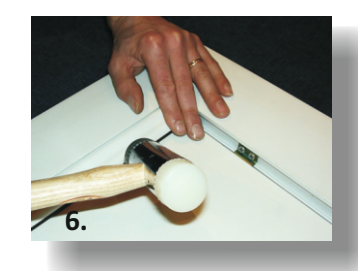
On some systems it may be necessary to notch centre pips and double leg beads around the Securi-Panel to obtain a flat base.

Unit 4203 Oakfield Close, Tewkesbury Business Park, Tewkesbury, Glos GL20 8PF