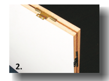
Repeat Step 1 to position two clips per corner