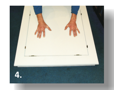
Position the panel into the aperture